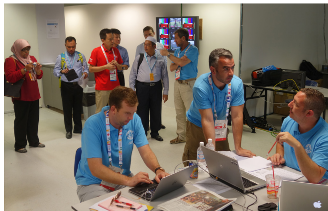
VIP visitors to the IBC Delegates from Brunei observe the Production facility at the IBC

A delegation from Brunei visited the IBC on Thursday. Their tour of the facility followed a similar trip by representatives from Malaysia – hosts of the 2017 SEA Games – as Singapore’s neighbours take interest in the 28 th SEA Games broadcast.