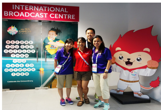
SINGSOC Broadcast team