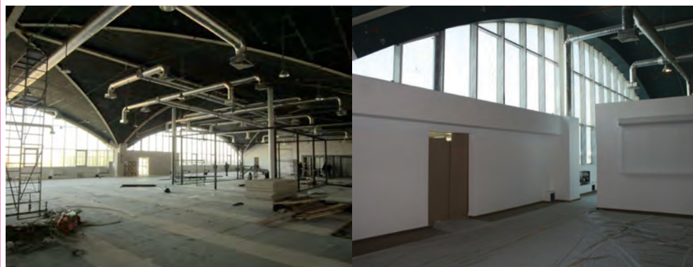
What a difference a month can make: at left the same IBC image that ran in the previous edition of the Rights Holders Newsletter; at right the state of construction last week.

Multilateral areas were delivered on 24 November. IGBS engineers began to install equipment and cabling a week ago and expect to have finished by the end of this week and furniture delivery is on schedule. All Rights Holder areas will also be completed by this coming Friday, with the "Stage 3" area (briefing room, offices and storage) expected to be finished next week.